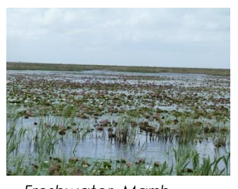
Freshwater Marsh, Photo by LDWF