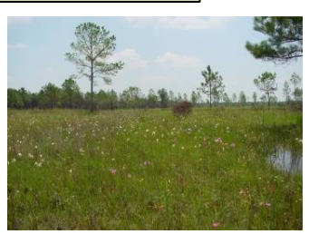
Longleaf Savanna, Lake Ramsey WMA