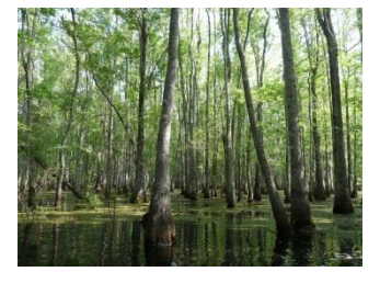
Forested Wetland, Photo by LDWF