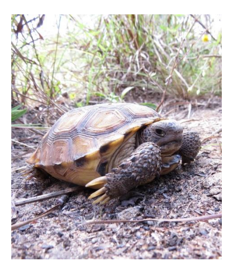
Work by Joint Venture Partners benefits birds and wildlife such as the Gopher Tortoise, Photo by LDWF

Bird-related outdoor recreation is a large and growing industry in the United States. Our partners' efforts on both public and private lands improve habitat for wildlife and provide recreational opportunities for individuals and families to enjoy.