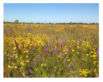
Fire-restored Prairie