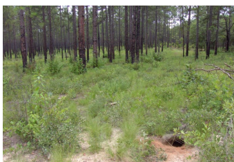
Gopher Tortoise Burrow

Develop Desired Forest Conditions for Southern Pine Ecosystems