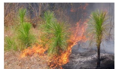
Photo: Longleaf Pine Seedlings

Develop Management Recommendations to Facilitate Achievement of Desired Forest Conditions