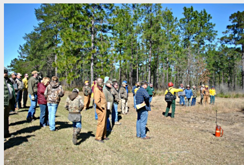
Private landowner workshop