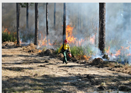
Prescribed Burns on Private Lands in MS, Photo by Melissa Moore

Joint Venture partners in Mississippi continue to make great strides in delivering prescribed fire on private lands with the Fire on the Forty campaign. Fire on the Forty seeks to promote and increase the use of prescribed fire on privately owned lands through a combination of outreach to educate landowners about the proper application of prescribed fire, hand-on workshops, and financial support. Funding from multiple partners including the U.S. Fish and Wildlife Service's Partners for Fish and Wildlife Program, National Fish and Wildlife Foundation, National Wild Turkey Federation, and the Mississippi Forestry Commission is allocated to the highest priority forestlands and grasslands in the state to maximize benefits to fire-dependent wildlife species. The program is administered by a committee of resource professionals from seven state, federal, academic, and private organizations. To learn more visit the Fire on the Forty website at http://www.mdwfp.com/wildlife-hunting/private-land-habitat/fire-on-the-forty.aspx