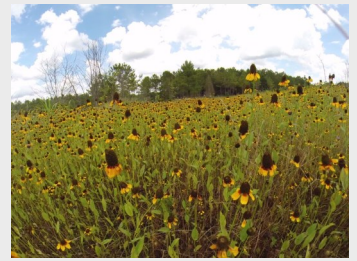
Native wildflowers colonized this prairie in Dallas County, AL following restoration

Additional goals include recruiting new partners and funding sources for restoration efforts, providing a forum for information sharing among science, delivery, and outreach specialists, and promoting the unique natural, cultural, and recreational values of the Black Belt region to the larger conservation community and the general public.