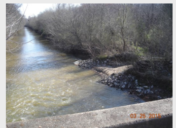
Opportunities for restoration of channelized portions of Forked Deer River

Tennessee Wildlife Resources Agency (TWRA) was awarded a North American Wetlands Conservation Act (NAWCA) grant for the Forked Deer River – Miller Tract Acquisition proposal. This funding will help to acquire 124 acres of forested wetlands, and represents a key section of the largest relatively intact bottomland hardwood forest in the region. This project will contribute towards long range plans to acquire and restore wetlands and will be managed as part of a new Wildlife Management Area in west Tennessee. Congratulations to TWRA for their continued success in acquiring NAWCA funds for conservation in the East Gulf Coastal Plain!